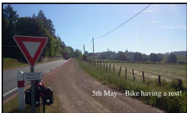
5th May—Bike having a rest!